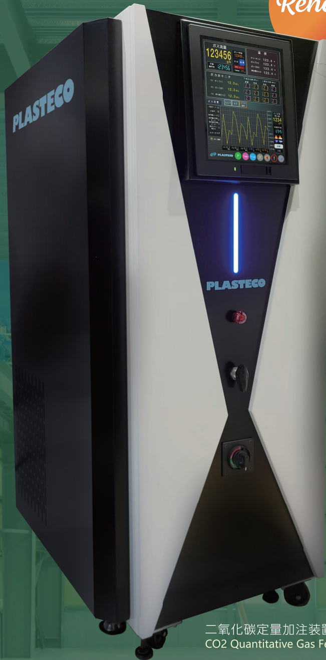
二氧化碳定量加注装置 CO2 Quantitative Gas Feeder