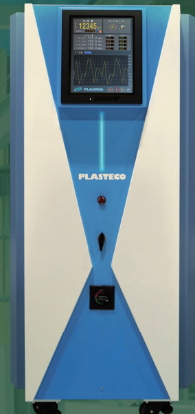
氮气定量加注装置 N2 Quantitative Gas Feeder

精密稳定的高压气体加注技术对超临界发泡塑料成形至关重要。 Indispensable for supercritical foam molding Precise and Stable High-Pressure Gas Feeder Technology